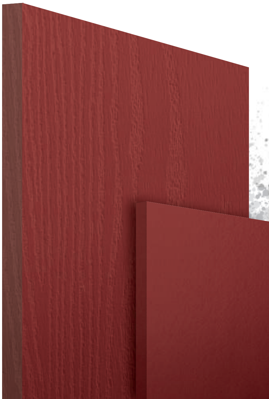
Premium / Marsala