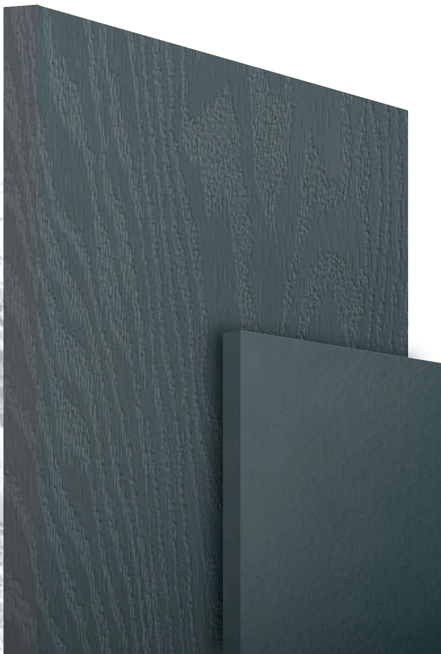
Premium | Military Grey