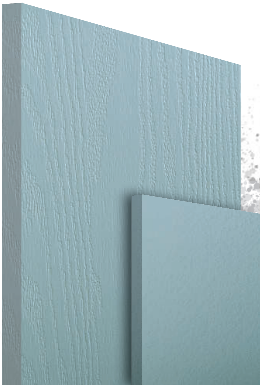
Premium / Wedgewood