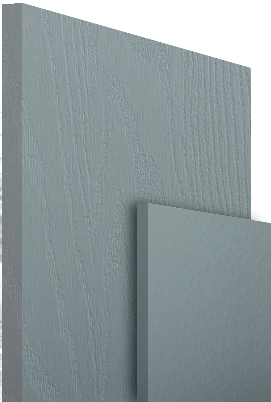
Premium | Silver Grey