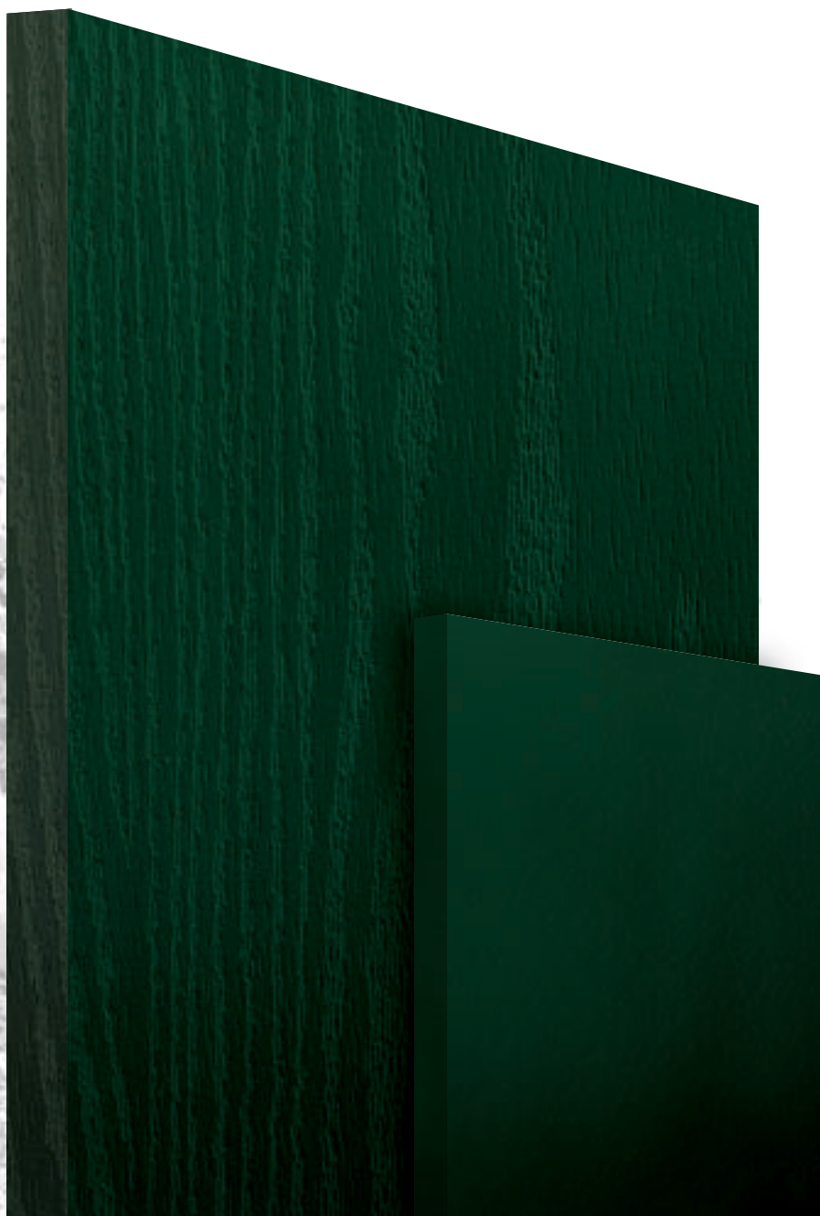
Standard | DOORCO Green