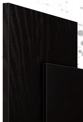
RAL 9005 (Jet Black)