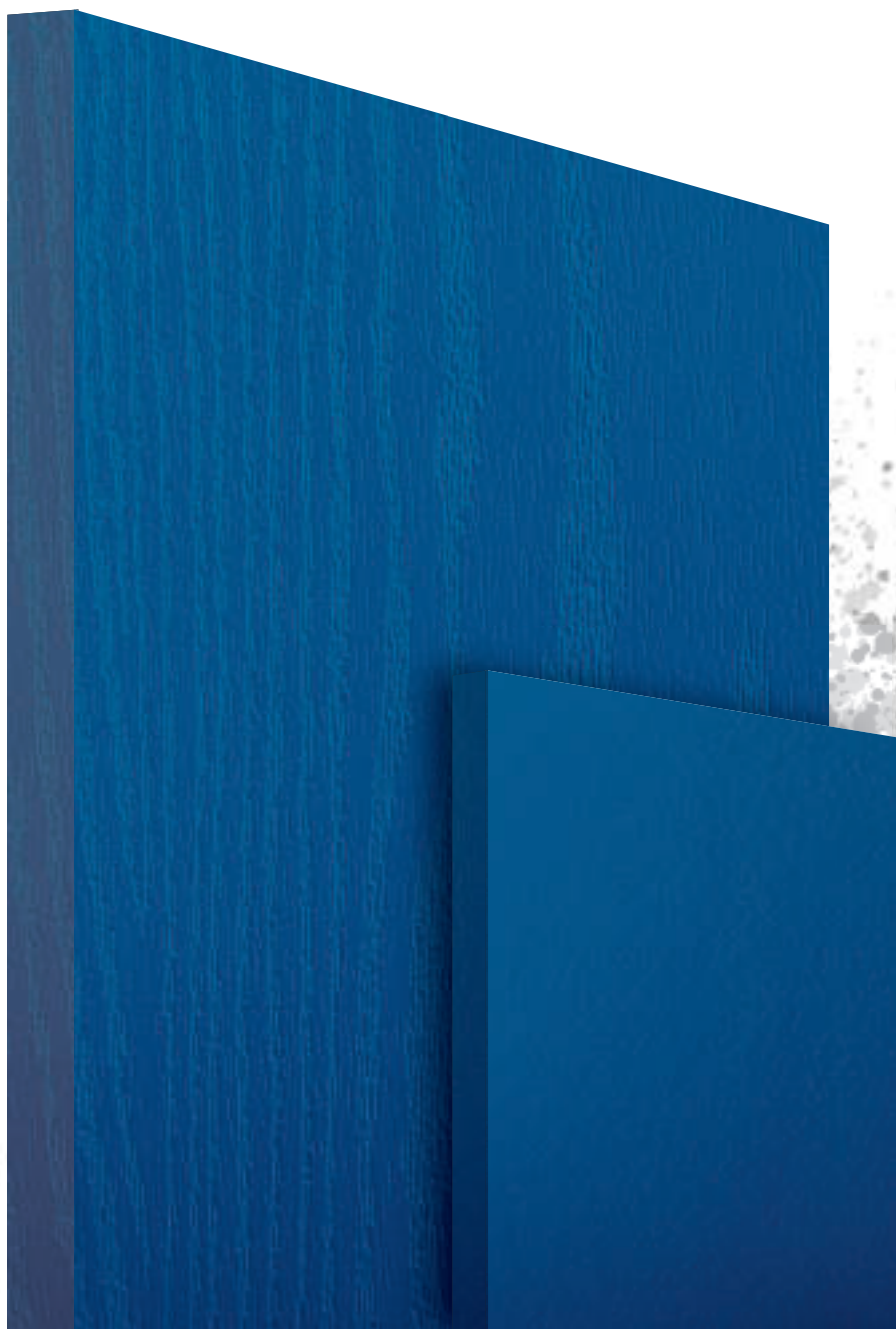
Premium / French Blue