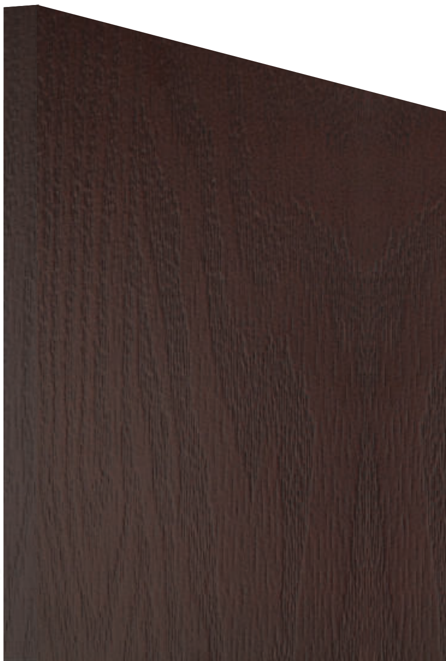
Standard | DOORCO Rosewood