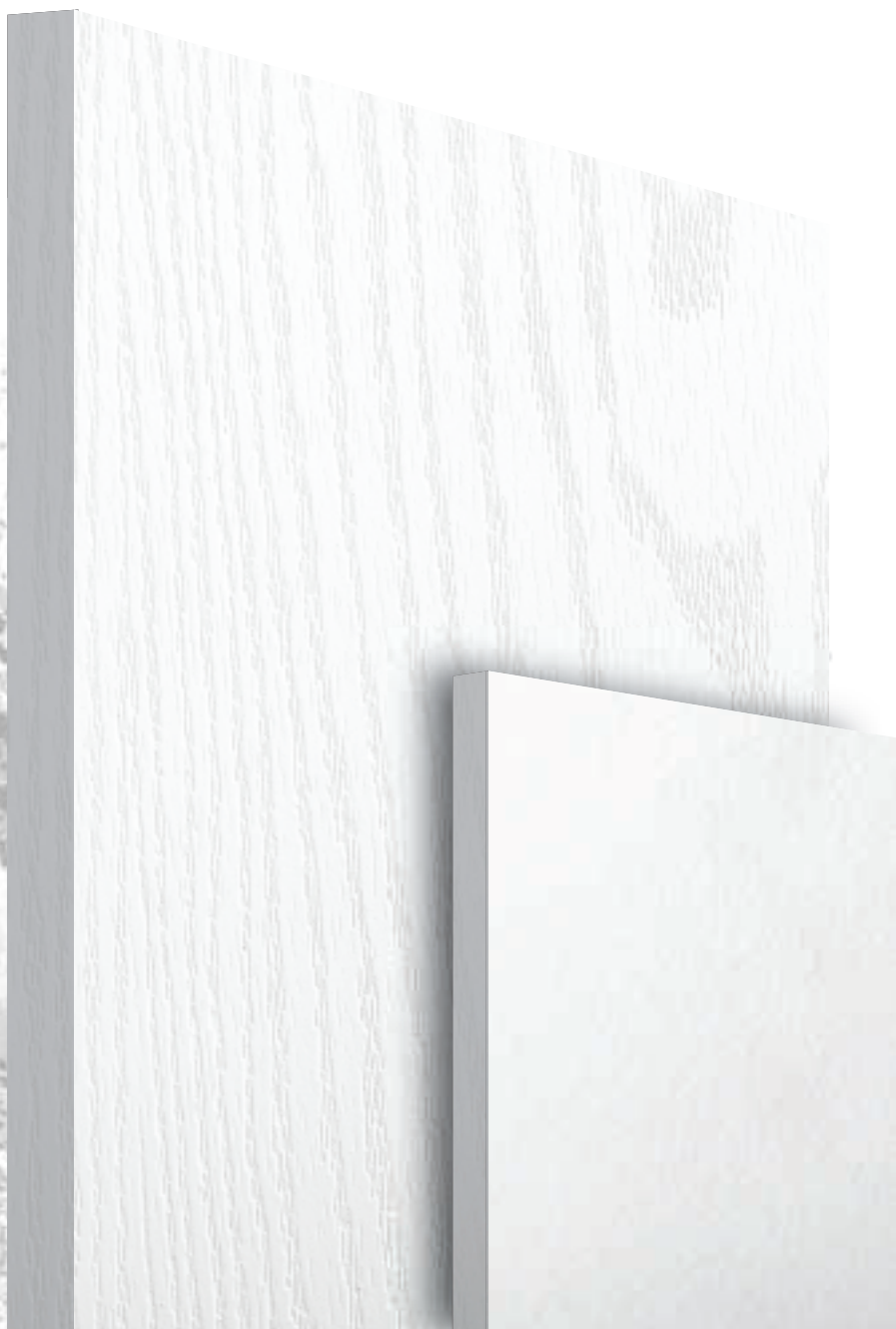
Standard | DOORCO White