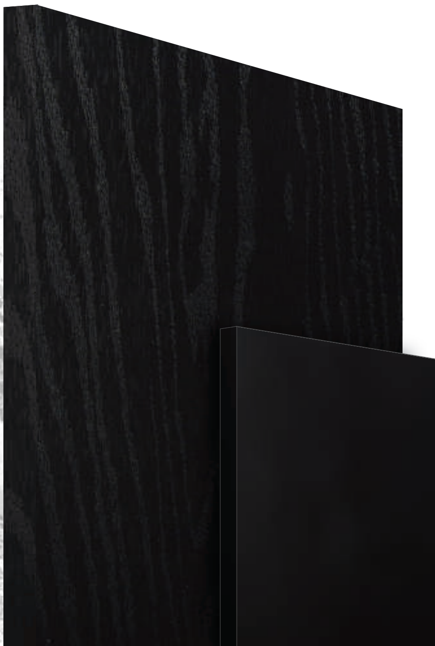
Premium | Black Ash/Beck Brown