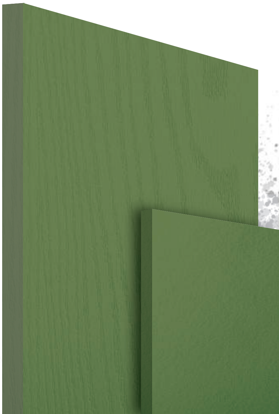
Premium / Paradise Green