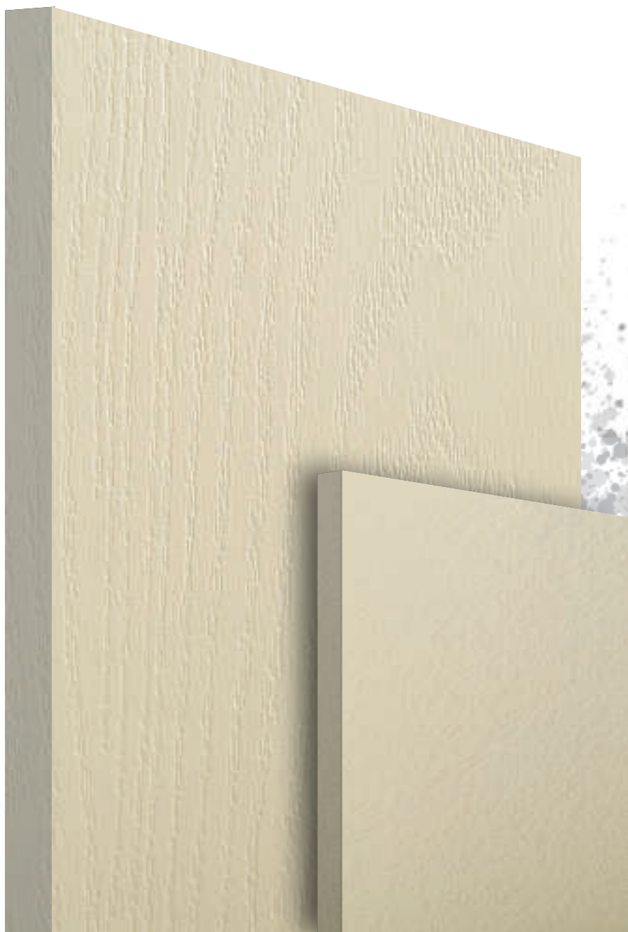
Premium / Clotted Cream