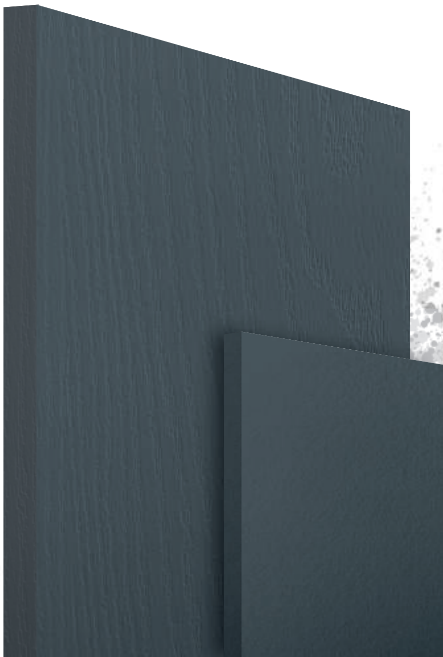
Premium | Slate