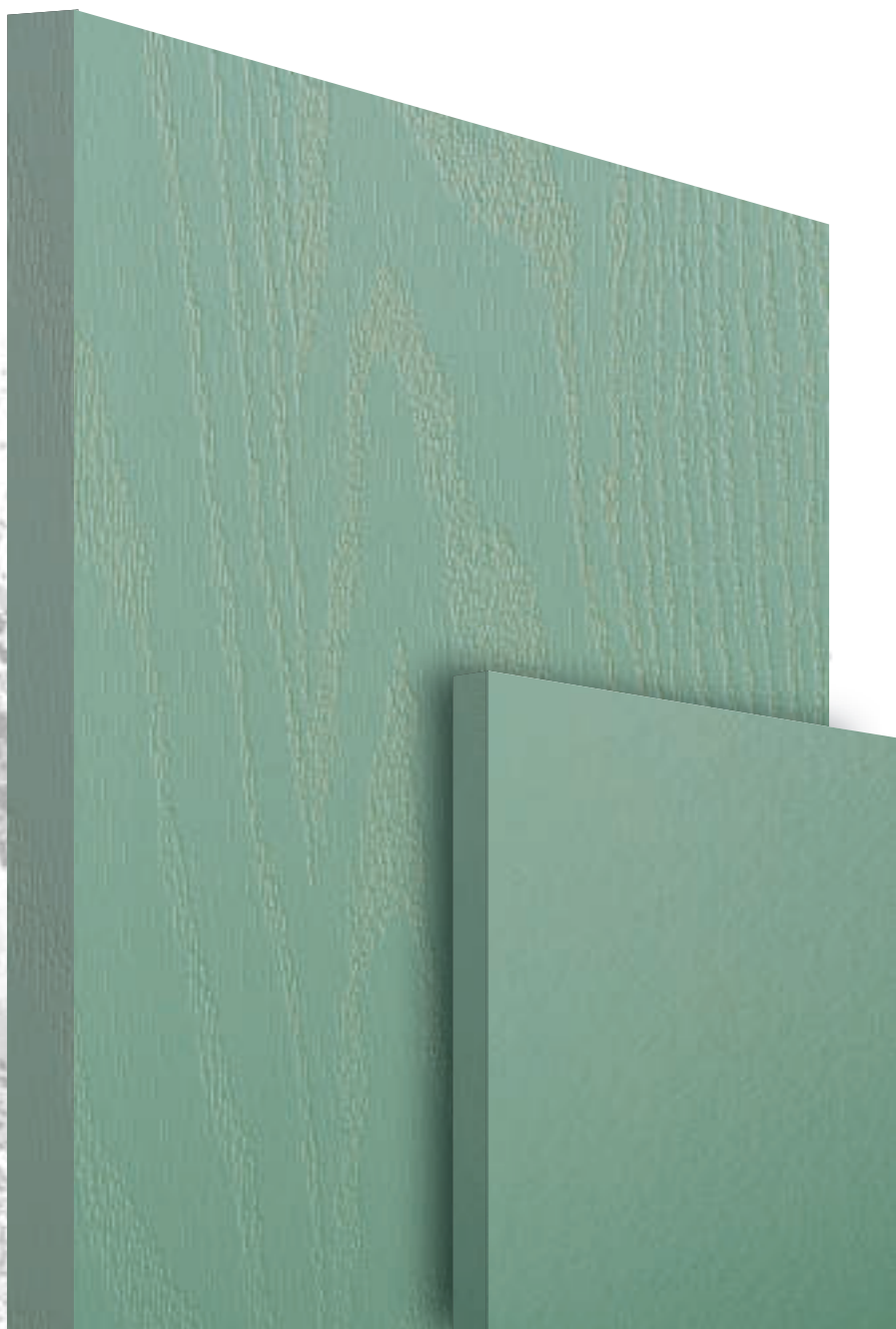
Premium | Chartwell Green