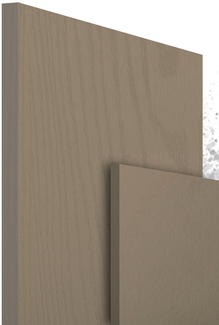
Premium / Putty