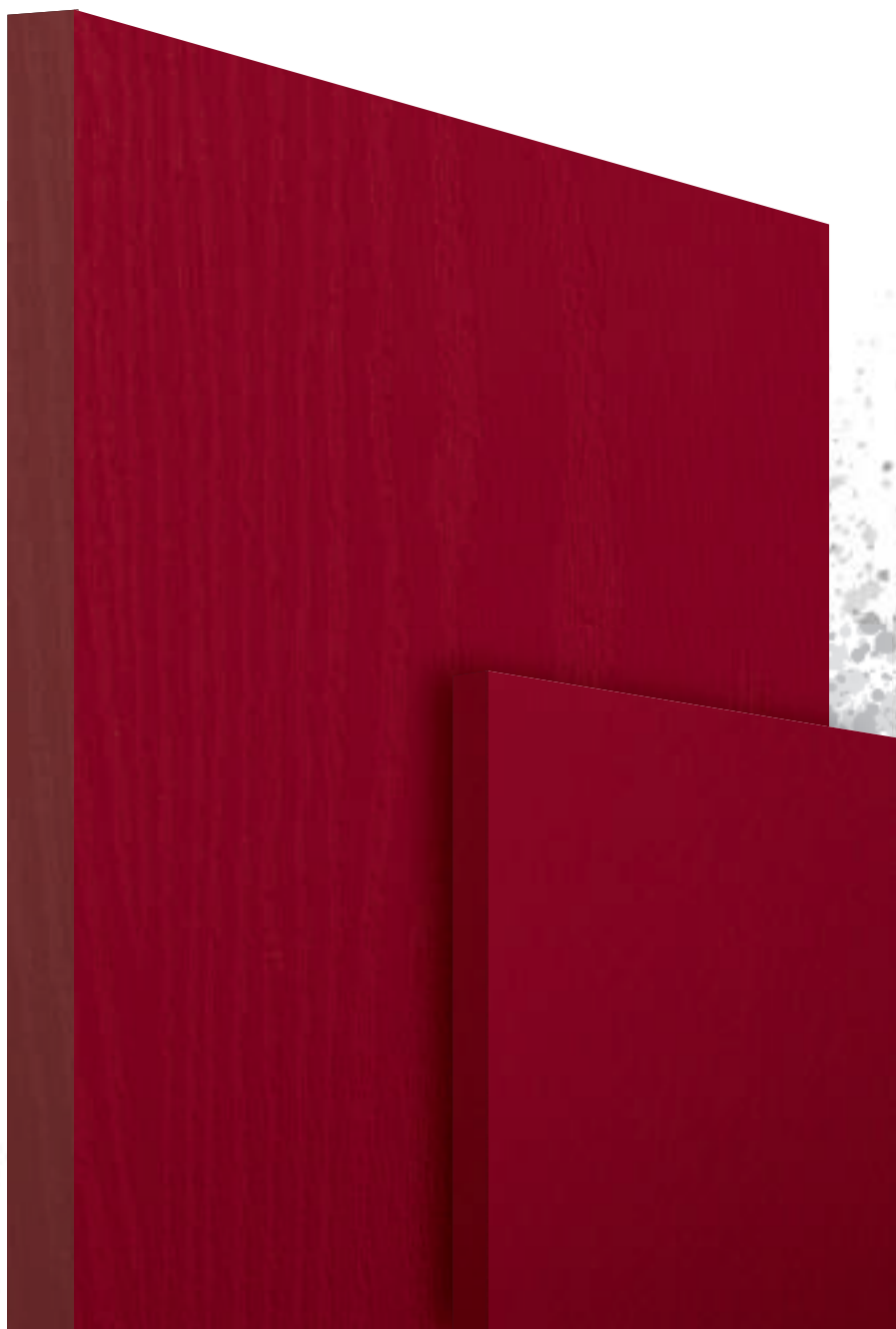
Standard | DOORCO Red