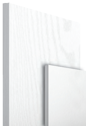
RAL 9016 (Traffic White)

DOORCO also offer other popular paint types such as BS, Dulux or Farrow and Ball.