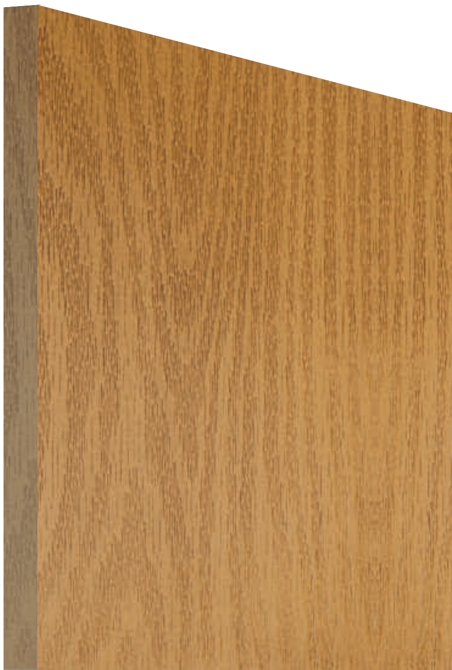
Premium / Irish Oak