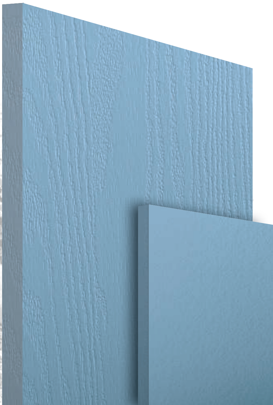
Premium | Cotswold