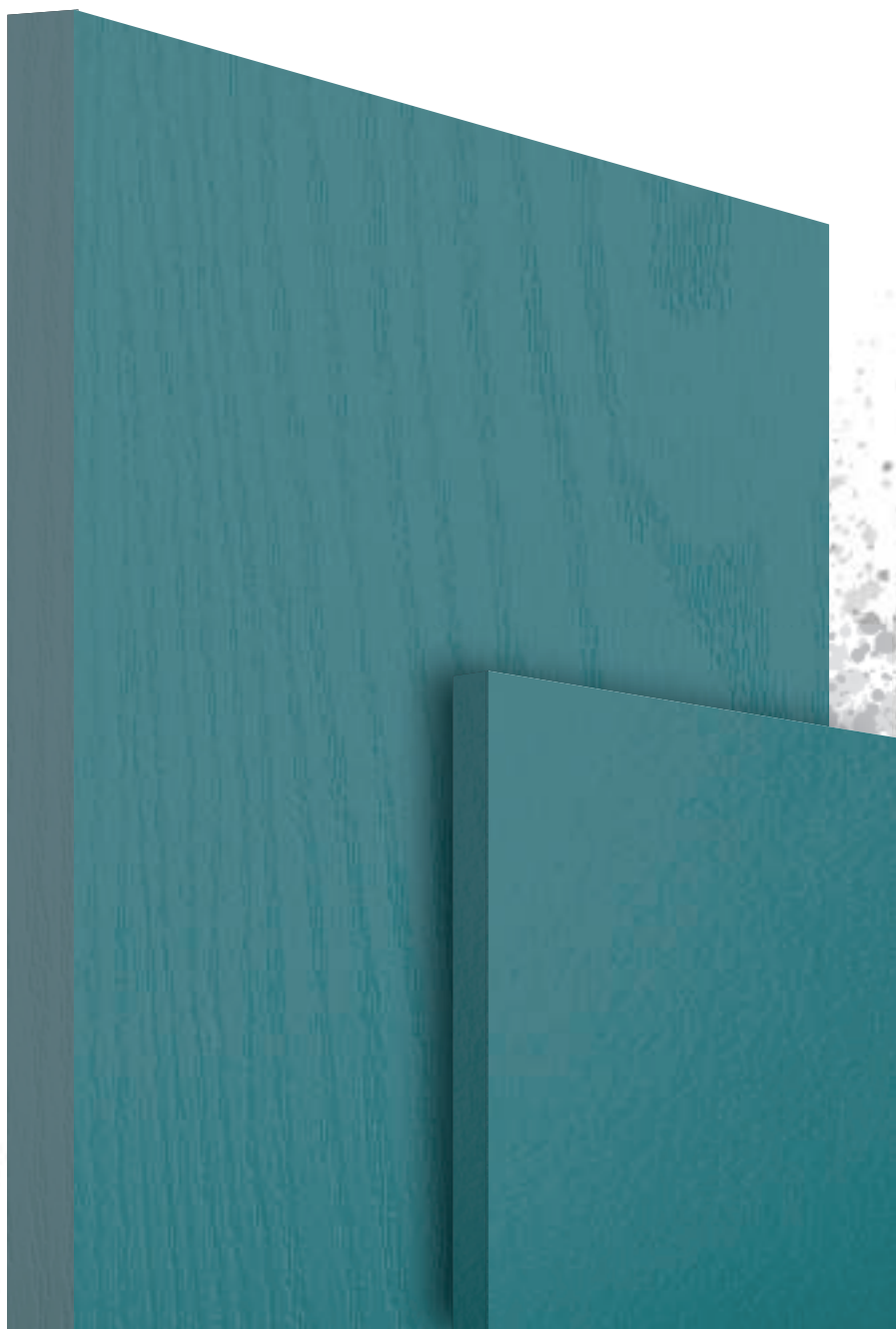
Premium | Caribbean Blue