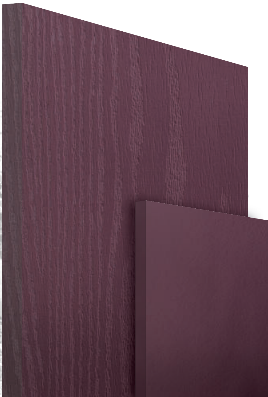
Premium | Mulberry