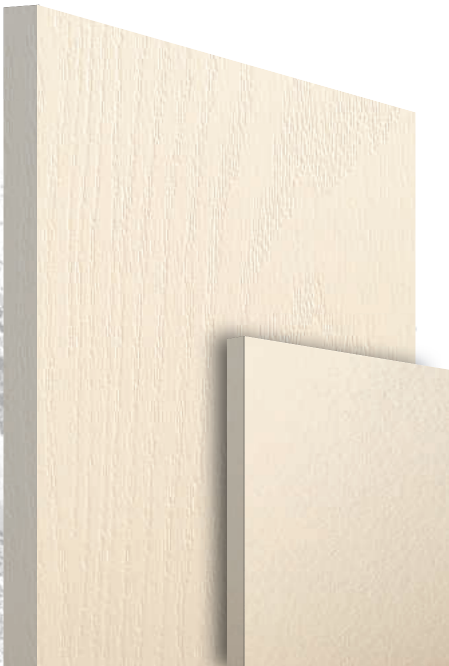
Premium / Cream White