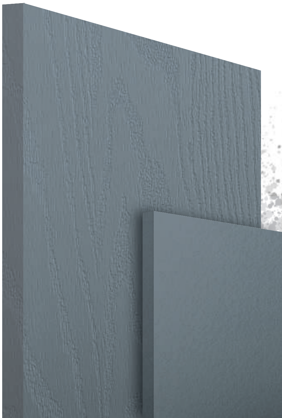
Premium / Shadow