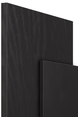
RAL 9011 (Graphite Black)