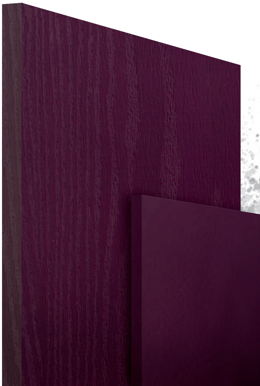
Premium / Very Berry