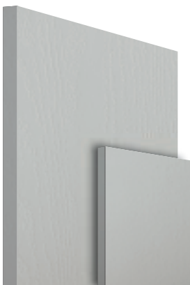
RAL 7035 (Light Grey)