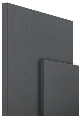
RAL 7012 (Basalt Grey)