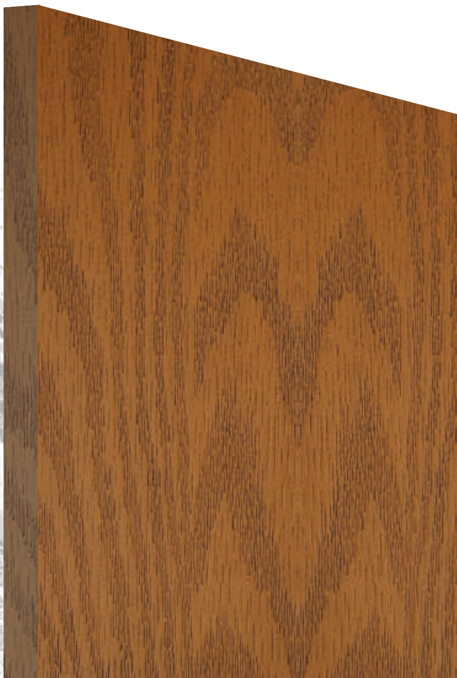
Standard | DOORCO Golden Oak