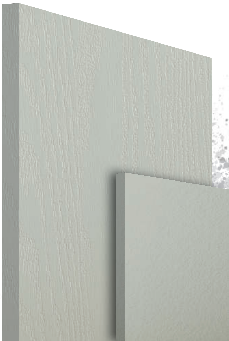
Premium | Agate Grey