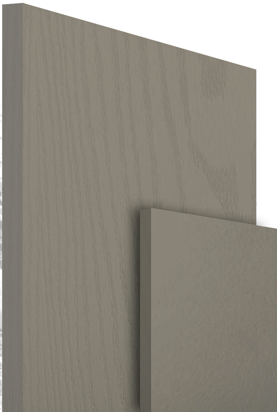
Premium | Mushroom