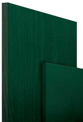
RAL 6005 (Moss Green)