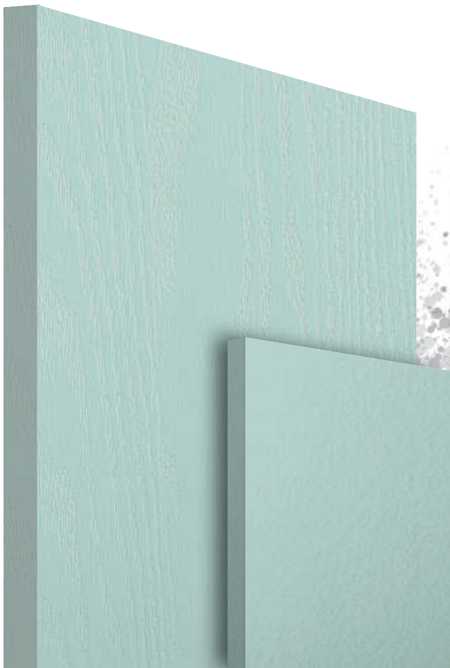
Premium / Moonshine