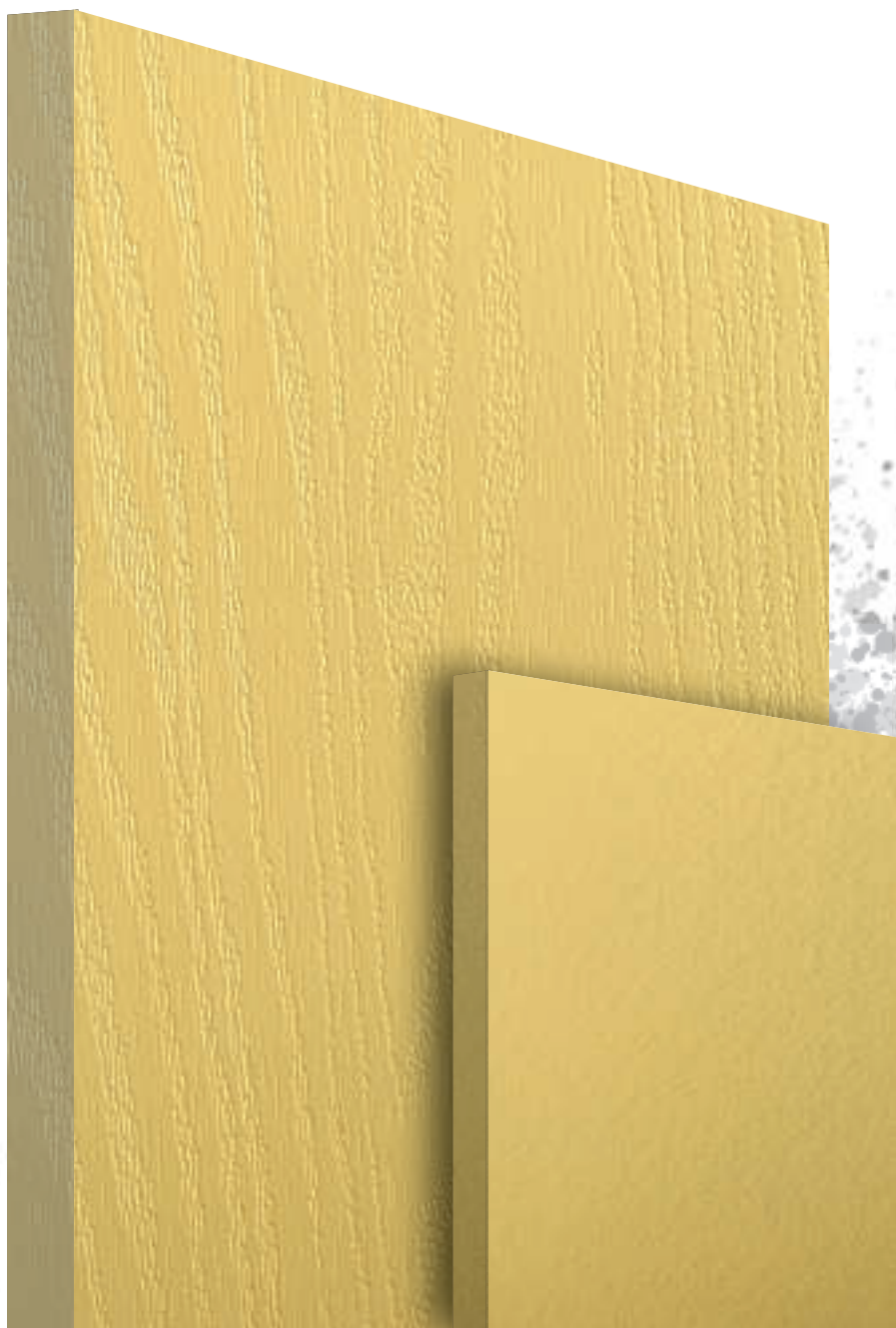
Premium / Citrine