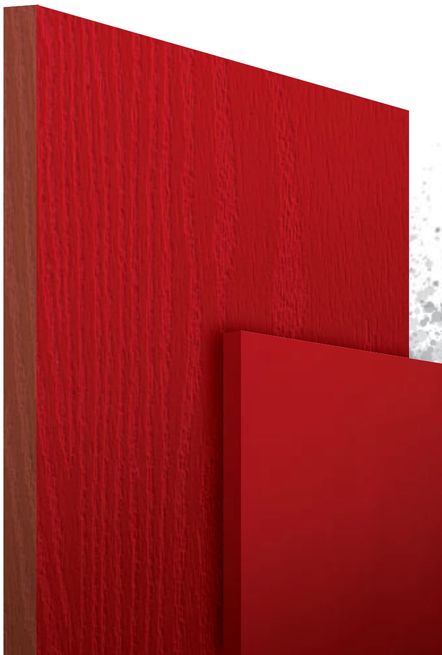
Premium / Diablo